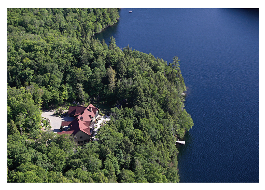
Private Jet Services Available at FBO: La Macaza-Mont Tremblant International Airport, about 25 minutes from the town.

1015 Cochrane - lac Desmarais This 14.000 sq ft waterfront home can accommodate two families. One side is perfect for a couple, while the other side works perfectly for the kids and grandchildren. Joining the two sides is an amazing summer kitchen, living room and dinning area. The home has several cinema rooms, fitness room, games room and two screened-in porches.